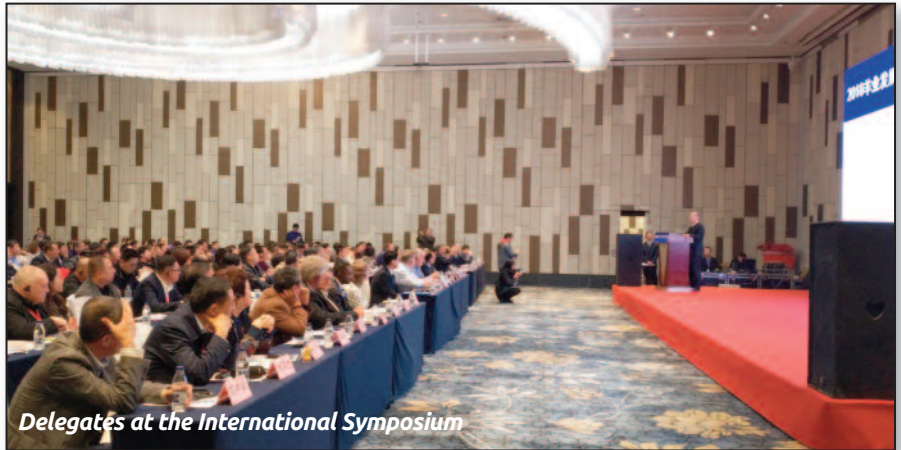
Delegates at the International Symposium

I made some excellent contacts at the VIV China trade show and the progressive sheep businesses seem very keen to explore genetic improvements.”