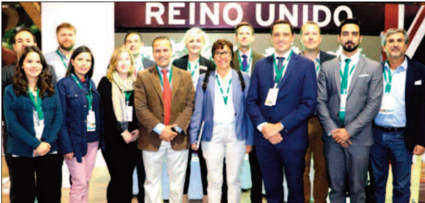
UK-Colombia Team at Agro Futuro

A strong UK presence at Agro Futuro, Bogota, Colombia 22-24 August 2018 was made possible with support from the Department of International Trade (DIT), UK-Colombia Trade, the British Embassy and the UK-Colombia Prosperity Fund.