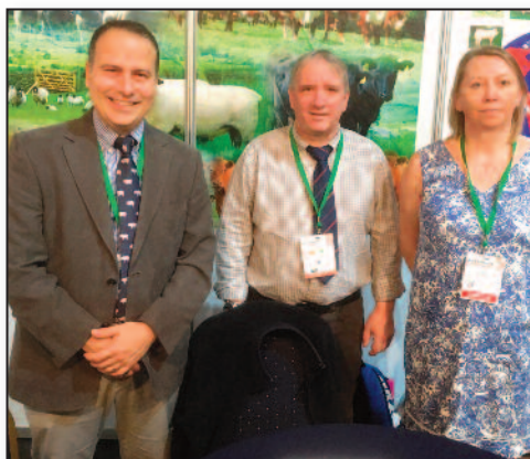
Representatives of the UK Pig Sector in Nigeria

sows, as well as nutrition and worming regimes, making enclosures and African Swine Fever. In addition to this we had a great many enquiries regarding cattle (dairy and beef), sheep and goats – in particular how well would animals from the UK adapt to conditions in Nigeria which are typically hot, humid and rainy for a large part of the year. There were also requests for training. It was refreshing to hear such enthusiasm for farming and to see that the Nigerian Government is actively encouraging young people into agriculture, recognising the importance of being able to feed the people of West Africa ●