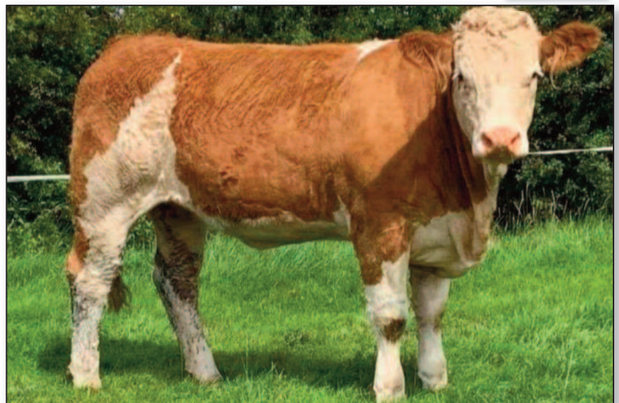
Denizes Cadette 37th

In looking specifically to source Simmentals from the UK, a representative of Horizon Genetics first approached the Barlows through Facebook. Extensive discussions and exchanges of pictures followed to meet Horizon's criteria of visual appearance, bloodlines, and performance figures. The required matings were established, and the embryos thereafter collected and subsequently exported through Mark Knutsford, Celltech Embryo Transfer Ltd.