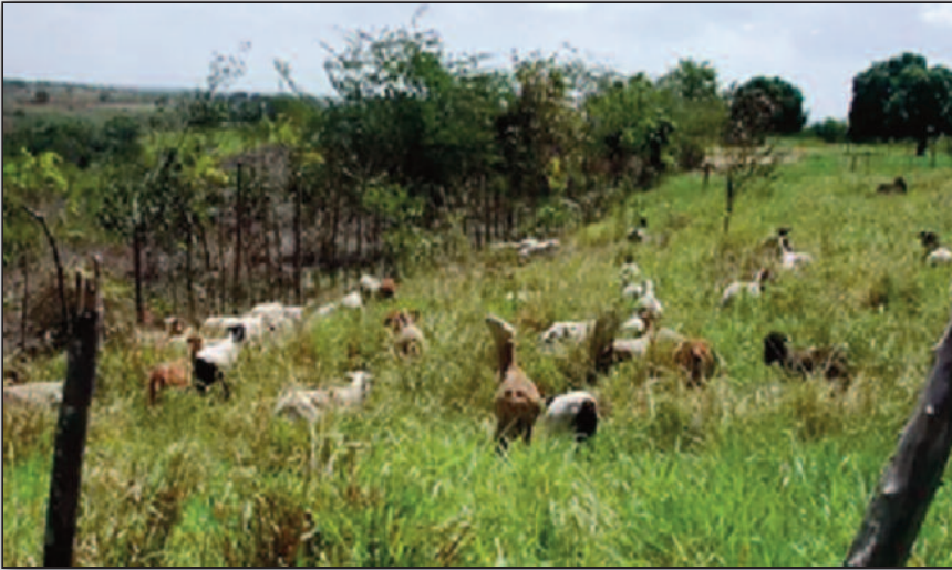
Typical sheep and goat grazing in DR

Sub-tropical places like the Dominican Republic traditionally keep 'Hair Sheep' – breeds like the Dorper, Katahdin, Blackbelly or Pelibuey that don't on the whole need shearing and are also tough and adaptable breeds to thrive on open ranges with little human intervention.