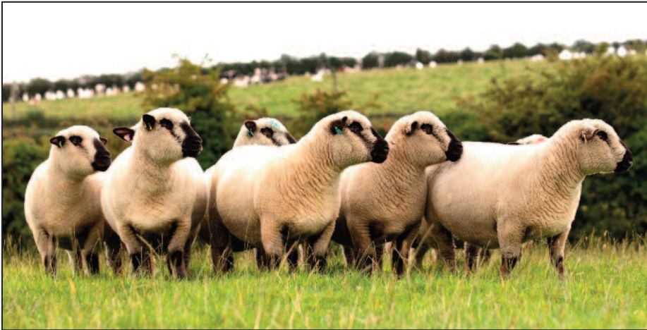
Ballycreelly Hampshire Down ewes