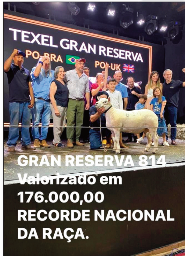
British genetics were prominent throughout the sale

British genetics were in demand throughout the sale which resulted in a new Brazilian record average of more than £3000. ●