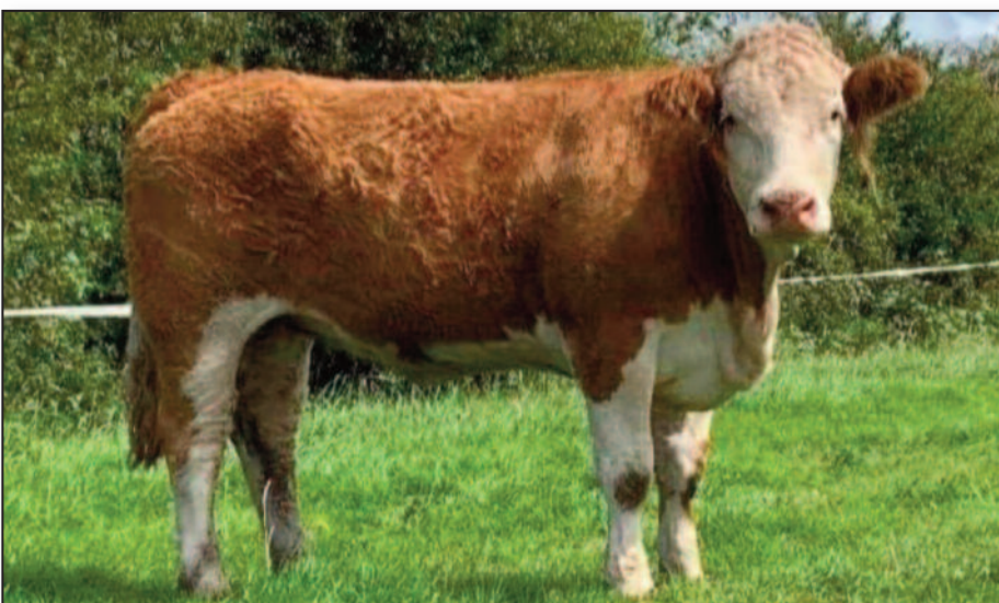
Denizes Nelly 8th

Nineteen Grade A embryos were collected and exported from the mating of the 2018 born Denizes Cadette 37th, a Kilbride Farm Delboy 12 daughter out of Denizes Cadette 28th, and the sire Ballinalare Galaxy 15. A further two Grade A embryos were exported from the mating of Denizes Nelly 8th, a Cairnview Snazzy daughter out of Denizes Nelly 5th, and sired by Brookwood Alla King. In both instances semen for the matings was supplied for the respective bulls by the Chester-based Cogent UK.