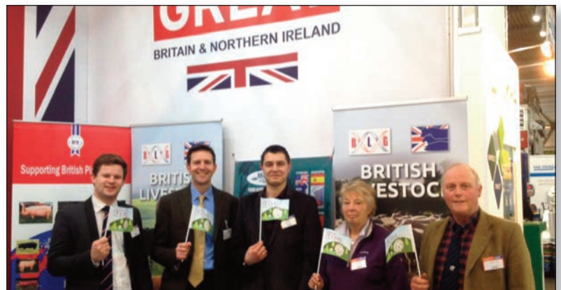
Livestock sector representatives in Ukraine