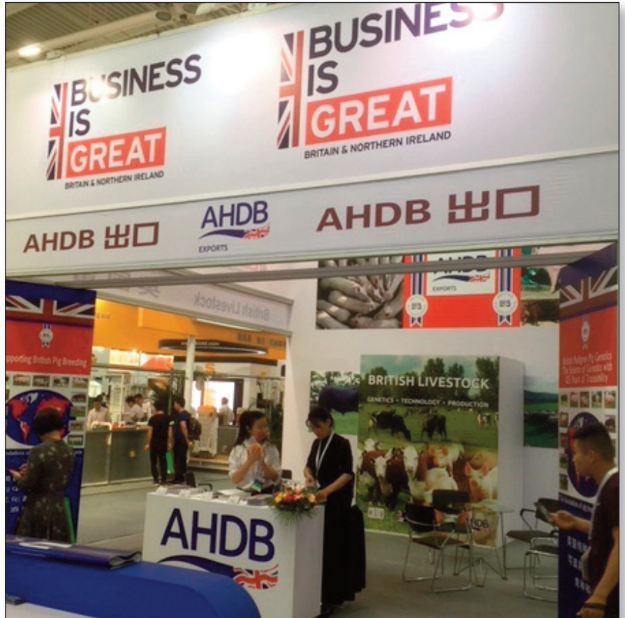
UK stand at CAHE China

Addressing an audience of 500 delegates made up of industry leaders, the themes of UK excellence and willingness to do business through the Department of International Trade (DIT) and Agriculture and Horticulture Development Board (AHDB) were pursued.