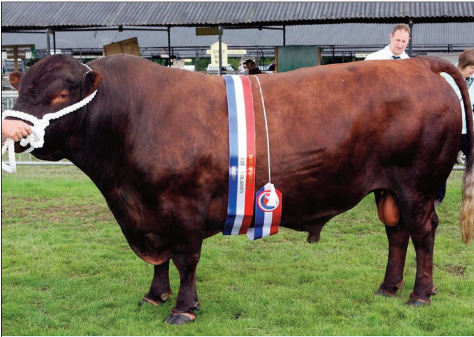
Red Poll Bull Fedw Stig. Tristan de Cunha

UK company exports bull semen to remote South Atlantic island