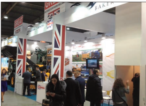
UK stand at Agro-Animal Show