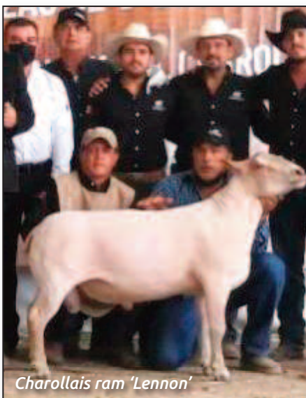
Charollais ram 'Lennon'