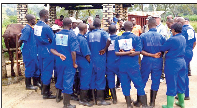
UKS training AI technicians in Rwanda