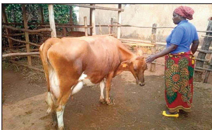
UKS F1 Jersey-cross female