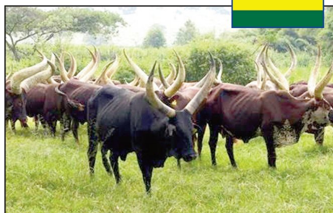
UKS Ankole cattle indigenous to Rwanda