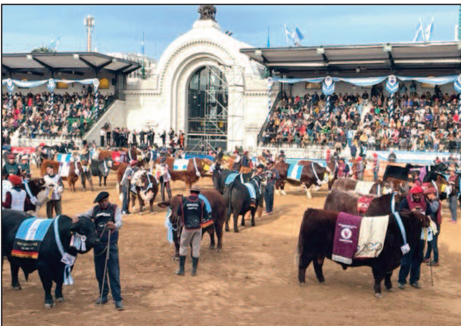
Shorthorns lead the Grand Parade at Palermo Show

The Argentinian beef population equates to around 52 Million head (beef and dairy combined) of which 30 million are breeding females (heifers and cows). The 30 Million comprises 28 million suckler cow/calf outfits and 2 million dairy females.